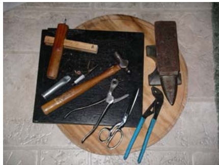
The tools I used

My mommy showed me a book with buckles in it and I found the buckle I used on my belt. I also saw how to tie a belt.